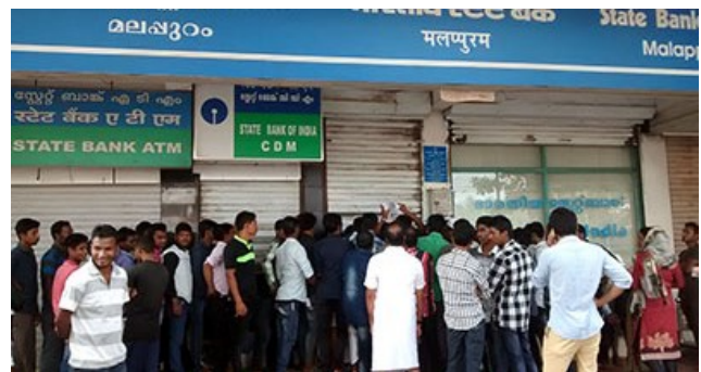
Figure 1. Line outside a bank before opening hours during demonetization

weekly limit of ₹20,000 (~US $300). These notes represented more than 85% of all currency used in India [1]. The move, commonly referred to as "demonetization," disrupted markets, caused commotion at banks (Figure 1), stock market and real estate drops [2] and even deaths [3] among those standing in long cash queues. The move was at the center of much discussion for its questionable economic logic [4, 5], its implementation without stakeholder consultation, and even its legal basis [6].